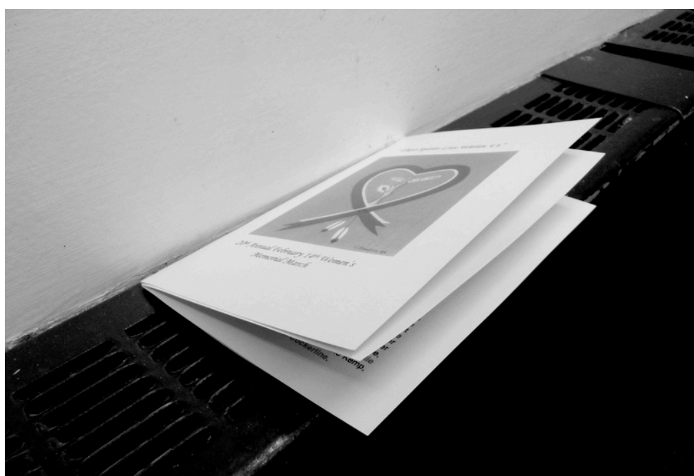
February 14 th Women's Memorial March in Squamish Territory